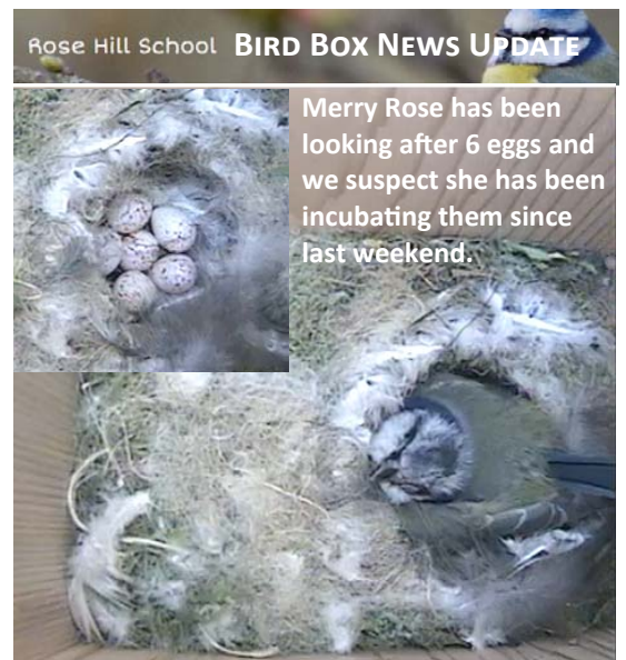
Rose Hill School BIRD BOX NEWS UPDATE

Year 2 Parents are invited to 4S Assembly on Thursday 19th May. Coffee will be served in the Y8 Common Room beforehand and a refresher tour of the Prep School will follow. Please inform the office if you will be attending.